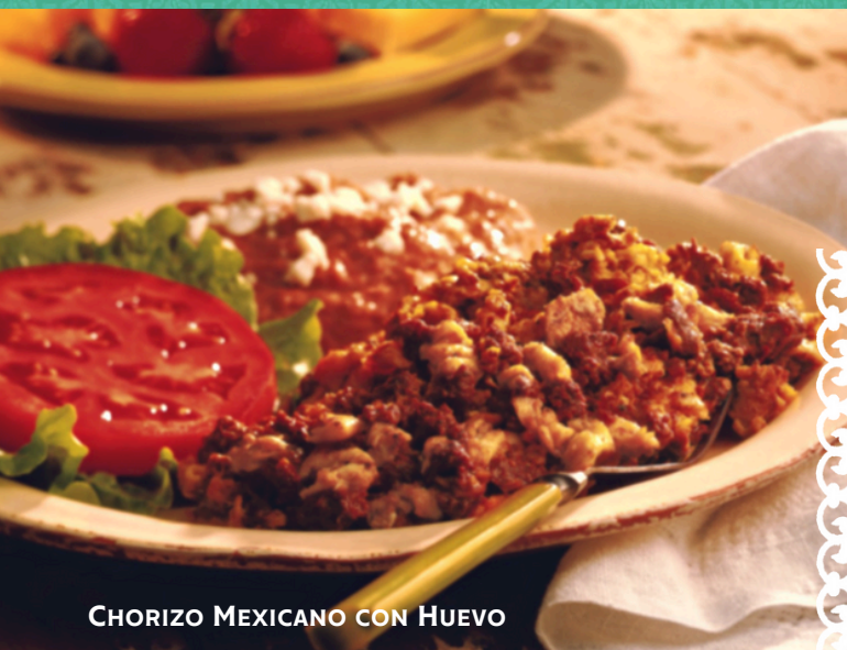
CHORIZO MEXICANO CON HUEVO

Two Eggs [any style], Breakfast Potatoes, Refried Beans, Tortillas and your choice of: Carne Guisada or Puerco en Chile Cascabel